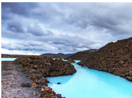
BLUE LAGOON, ICELAND

For four days, tour fascinating Iceland—from the sights of the capital city, Reykjavik, to the hot springs and waterfalls of Thingvellir National Park. You'll also stop to enjoy a soak in the famed Blue Lagoon, a natural geothermal spa. Includes all hotels, breakfasts and transfers.