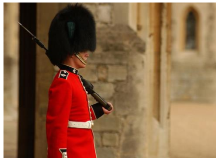
LONDON, UNITED KINGDOM

In Oslo, view the world's best preserved Viking ship at the Viking Ship Museum and see the Royal Palace. Board a train to Bergen for a stunning journey over the Hardangervidda, Europe's highest mountain plateau. Includes all hotels, breakfasts and transfers.