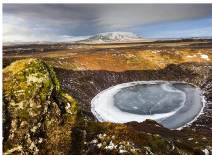
KERID CRATER, ICELAND

EXTEND YOUR JOURNEY BEFORE OR AFTER YOUR CRUISE. Make the very most of your time away from home by extending your journey with one of our city stays or tours. Spend a little more time in these great destinations. Our expert local guides and hosts will help you get the very best from your stay.